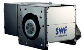
NOVA L Single girder trolley, low headroom, up to 12,5t